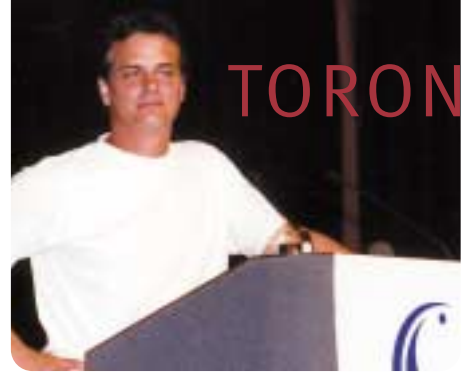
Keynote conference speaker Paul Gross.