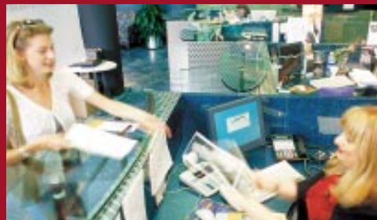
Provide your resumé and headshot to a Member Services Rep.