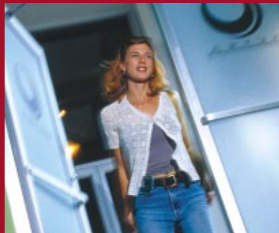
First, visit your local ACTRA office.