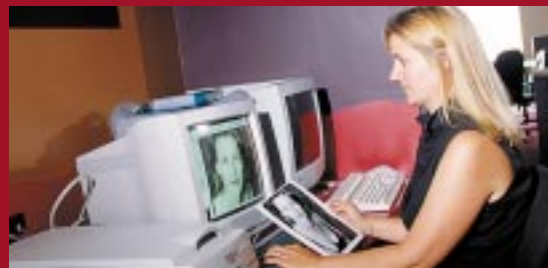
Your headshot, resumé and other photos will be scanned in.