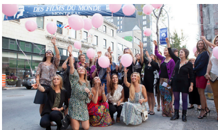
Beauty and the Beast Montreal's Premiere