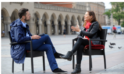
Interview with "Question for Breakfast" a top rated TVP show