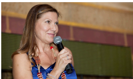
Beauty and the Beast Montreal's Premiere