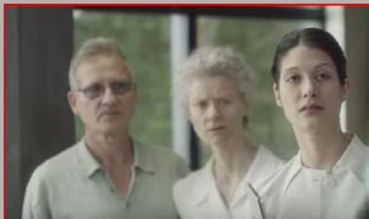
FRANCE Chocapic Sauve l'enfant qui est en toi !

We clearly see me enter with my wife and a building officer