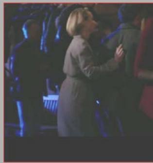
Enregistremetn avec moi: Quantico