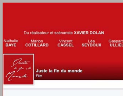
Facebook: Juste la fin du monde