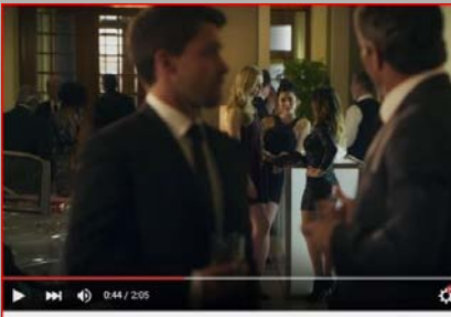
The Art of More – Official Teaser Trailer – Crackle

YouTube: The Art Of More (Bande annonce)