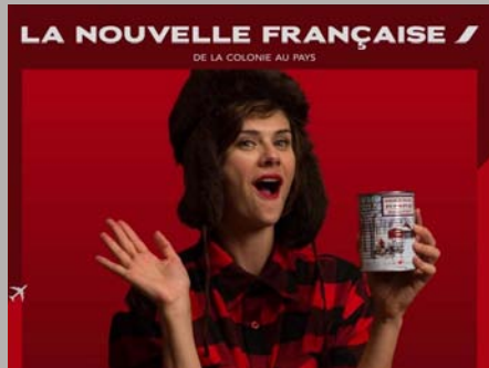
kickstarter.com: La nouvelle française

My participation in this production was 1 day.