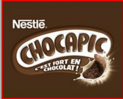
Site officiel: Nestlé France