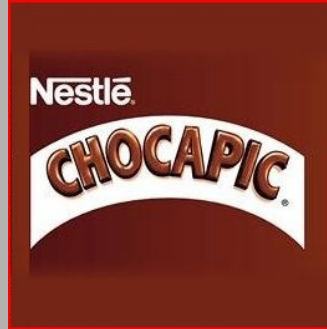
Facebook: Site officiel Chocapic