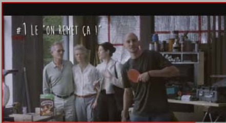
Chocapic - 8 mouvements de danse pour libérer l'enfant qui est en toi !

I have to show some expressions of my face: I'm surprised to see construction employees who play table tennis when they should work.