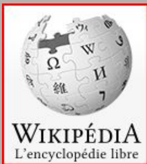
Wikipedia: Juste la fin du monde (film)

My participation in this production was 1 day. Walker and driver of a BMW 328 convertible blue car in front of the exit of the airport. There is not much information on this film yet. The film is not out yet.