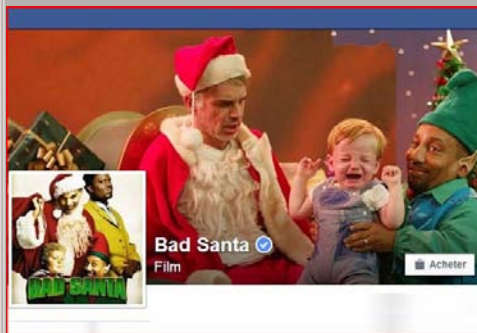
Facebook: Bad santa Film