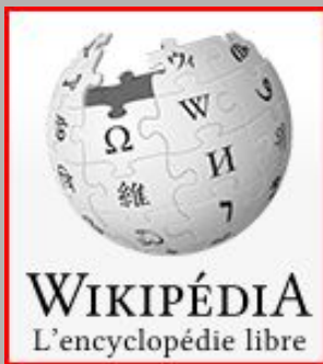
Wikipedia: Mauvais Père Noël