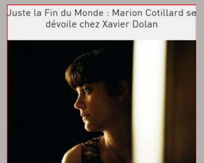
Premiere.fr: Juste la fin du monde