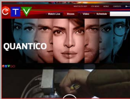
CTV: Quantico (série télévisée)