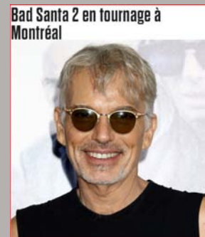
Journal de Montréal: Mauvais Père Noël 2

My participation in this production was 2 nights for 29 hours of work in addition to the meal times and my travel from Contrecoeur to Montreal.