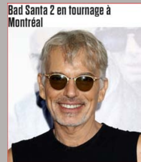
Journal de Montréal: Mauvais Père Noël 2

My participation in this production was 2 nights for 29 hours of work in addition to the meal times and my travel from Contrecoeur to Montreal.