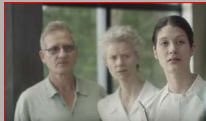
FRANCE Chocapic Sauve l'enfant qui est en toi !

We clearly see me enter with my wife and a building officer