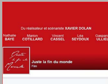
Facebook: Juste la fin du monde